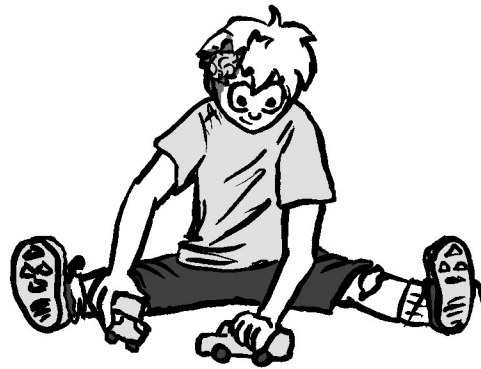
Zombie Tim plays with his toy cars.

The Zombie Rights Campaign was founded to foster peaceful coexistence between the Living and the Differently Animated, and we labor almost as tirelessly as the Undead themselves, toward a happier and more tolerant future.