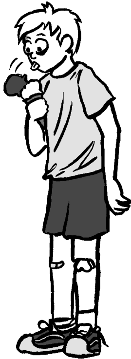
Zombie Tim likes ice cream just like Living children.