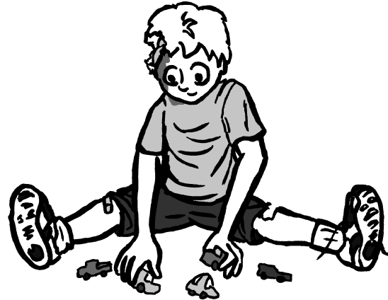
Zombie children play with toys too.

The Zombie Rights Campaign was founded to foster peaceful coexistence between the Living and the Differently Animated, and we labor almost as tirelessly as the Undead themselves, toward a happier and more tolerant future.